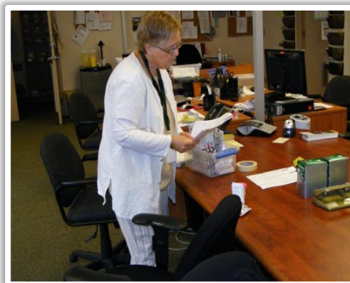
VICOT MEMBER GATHERING MEDICATIONS FOR CLIENTS