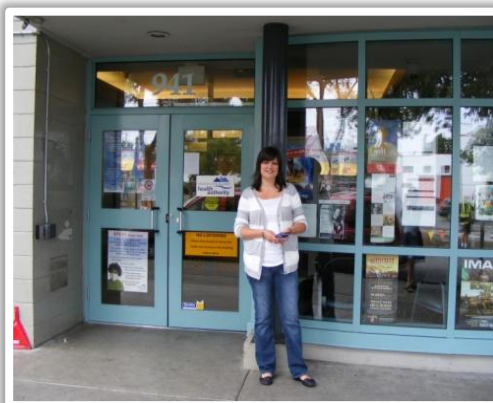
DACT MEMBER AT VIHA OFFICES