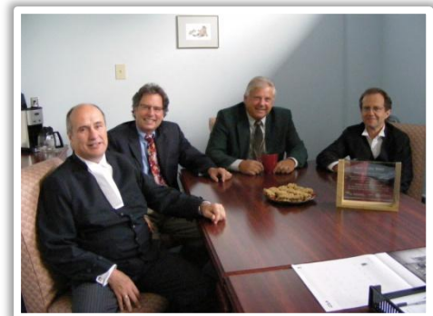
DVBA AND CHAMBER OF COMMERCE SUPPORTERS WITH THE VIC JUDGES

The challenge accepted by everyone was to look for efficiencies and to focus existing resources on this defined population in our community. It was understood this could only be done if all participants remained within their respective organizational structures, and work proceeded through ongoing electronic communication and weekly meetings at the courthouse. It was also agreed that if any additional resources became available they should be directed exclusively to increasing integrated services in the community and not to enhancements of the court facility or associated administrative functions.