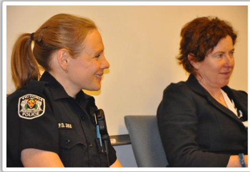
POLICE AND CROWN COUNSEL IN PRE-COURT PLANNING MEETING