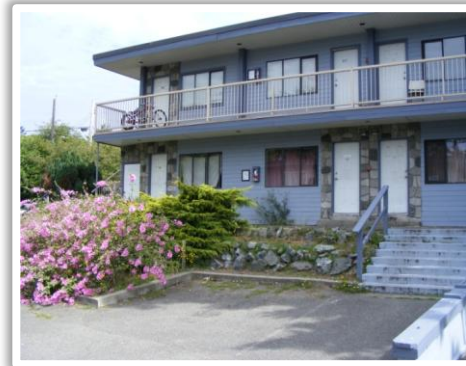
LOW BARRIER HOUSING

In addition to the services offered by the ACT teams, Community Living BC (CLBC), a provincial Crown agency mandated under the Community Living Authority Act , provides support and services to adults with developmental disabilities. CLBC assists these individuals with building social and life skills, connecting to appropriate housing, and obtaining employment. Under its umbrella, CLBC funds a Community Response Team which provides support to those adults with developmental disorders who demonstrate extreme behaviours, psychiatric disorders and/or have critical health needs. CLBC also offers the Personalized Support Initiative, a program that provides specific supports to individuals with a diagnosis of Fetal Alcohol Syndrome Disorder or Autism Spectrum Disorder who have significant limitations in adaptive functioning. Services provided by CLBC may involve support to individuals in conflict with the law who are required to appear in court and who may be under a probation order or serving a conditional sentence in the community. Community Response Team may also assist individuals who are incarcerated but are facing release from custody and may assist with transitional planning to reintegrate into the community.