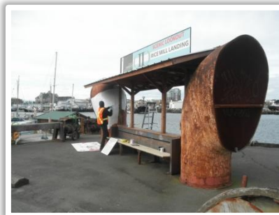
COMMUNITY WORK SERVICE BEING PERFORMED