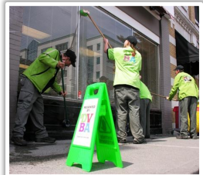
THE CLEAN TEAM