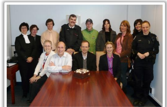
THE VIC'S FIRST ANNIVERSARY

The VIC held its first hearing as planned on March 16, 2010 and has now been in operation for just over one year. During this time, the VIC has dealt with a variety of offences. While the majority of the offences were for shoplifting or public nuisance offences, the court has sentenced persons for offences including: breach of court orders, assault, mischief, uttering threats, domestic violence, fraud, breaking and entering, indecent exposure, and robbery.