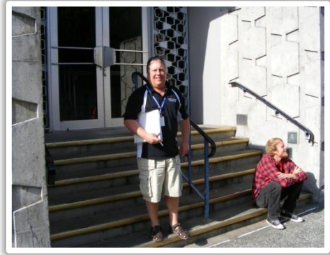
TEAM MEMBERS OUTSIDE THE COURTHOUSE

Finally, the court hears from the offender, who is invited to speak but is not required to do so. The judge also seeks to engage the offender by explaining the court's decision and expectations.