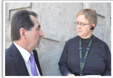
FIRST COUNSEL AND TEAM MEMBER TO BRING A CLIENT TO THE VIC

This led the Provincial Court, with other members of the justice system, to initiate dialogue with the agencies supporting the ACT teams and to explore the idea of working with the teams to implement an integrated court in Victoria without using new resources. The intention was to explore the possibility of the court imposing more effective sentences by, in part, working with the teams and the community in the provision of integrated services for these offenders.