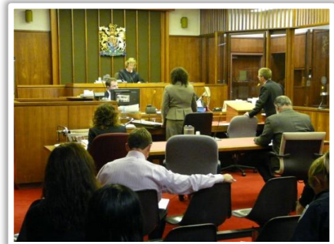
9 A.M. SITTING OF THE VIC